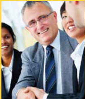
Dreaming of retiring early?