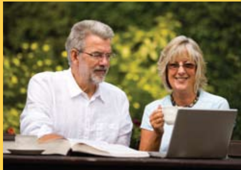
Thinking about becoming your own boss?